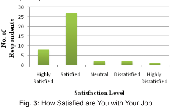
Question 3: Overall how satisfied are you with your job?

This was a direct question asked from the employees as to how satisfied they were with their job. Majority of the employees were satisfied with their current job. Some of them were highly satisfied as well and a very low percentage was neutral, dissatisfied and highly dissatisfied. This means that most of the employees surveyed were being provided what they wanted with their job as a result they were satisfied with their job but less no. of employees were highly satisfied. This only means that the satisfied employees were of the view that there is still some scope of improvement.