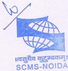
Name and Signature of Director

Name and Signature of Faculty In-charge / Coordinator